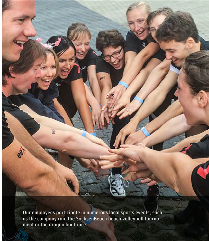
Our employees participate in numerous local sports events, such as the company run, the SachsenBeach beach volleyball tournament or the dragon boat race.

As a global group, we strongly value sustainable corporate governance. Not only does this include the protection of the environment in our daily work, such as reducing waste or recycling, but also the support of social projects at our various locations as well as numerous activities we offer our employees.